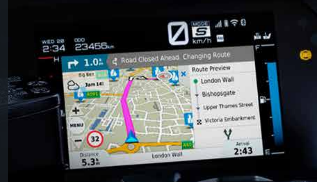
Connected TFT screen, full-map navigation

Operated by a simple joystick, the sophisticated connected full-colour 7-inch TFT screen features a choice of three display styles. Through Yamaha's MyRide App you can access MyRide - Link that enables the connection with the vehicle, giving access to your smartphone for music, weather, calls** and notifications. Full-map Garmin Navigation* makes every journey easier - while texts can be displayed when your TMAX is parked. (*Full-map Garmin Navigation requires a subscription service agreement and is not offered in all countries. Some navigation features are not available in all countries, please check with Garmin for availability. **Requires Bluetooth connected headset linked to the TMAX. Headset not included.)